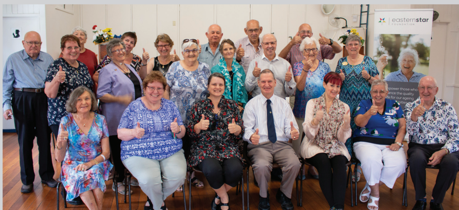
Company Members enjoyed being updated at the recent AGM

OES members and grant seekers easy access to the information they need, as well as news stories about the foundation's philanthropic work. Visit www.easternstarfoundation.org.au to find out more.