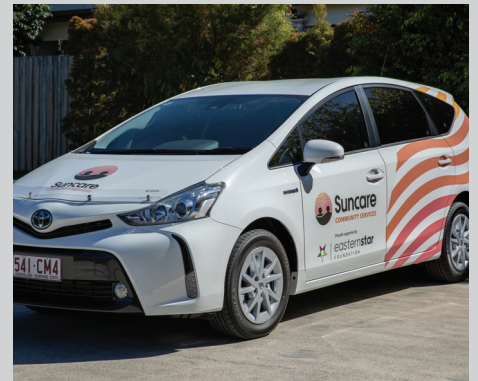
Suncare's program supports 40 people on the Sunshine Coast and Brisbane