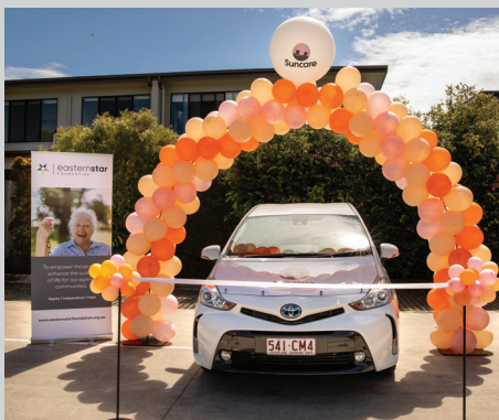
ESF provided a $45,000 grant for Suncare's new vehicle and its running costs for a year