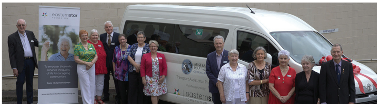
Photo: Directors of Australian War Widows Queensland (AWWQ) and Eastern Star Foundation (ESF) at the unveiling of the new minivan funded by ESF.

Since 1947, Australian War Widows Queensland (AWWQ) has supported the widows and families of those who fought for our country in the armed forces.